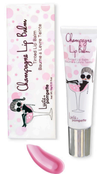
TINTED LIP BALM