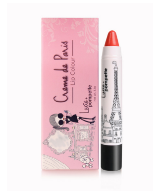
CREME DE PARIS LIP COLOUR